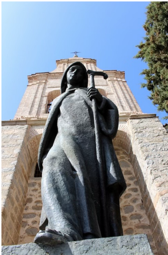
Teresa of Ávila, Ávila Spain